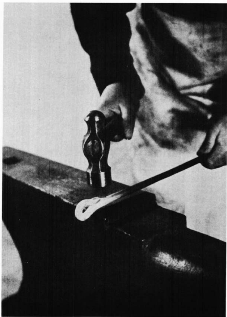
THE BLACKSMITH'S CRAFT